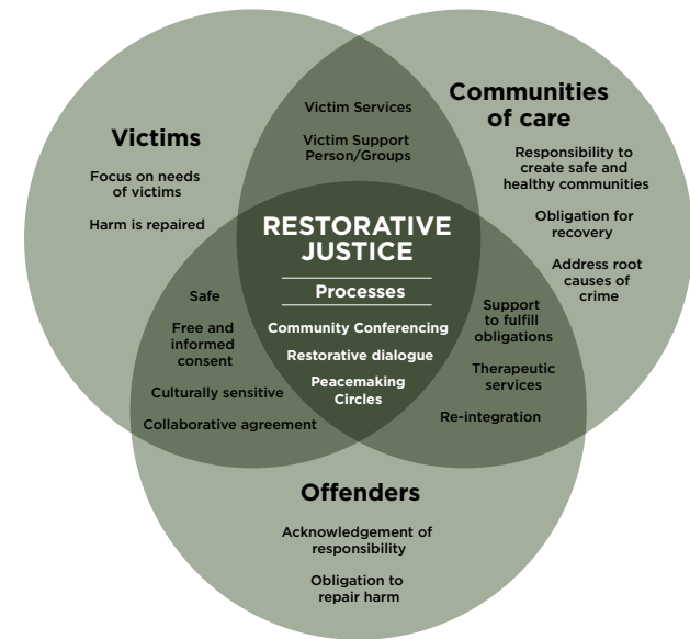
How Restorative Justice Works

This approach to crime involves a recognition that there are multiple pathways to justice and that justice is defined in different ways for different people. Studies of other jurisdictions that have incorporated restorative justice into their justice system report timely access to justice, increased satisfaction with the outcomes, lower rates of recidivism, and cost savings to the judicial system overall.